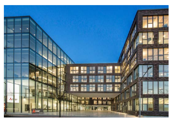
Consequently sustainable with renewable energies and intelligent energy control: the new building of the German Branch of Mitsubishi Electric