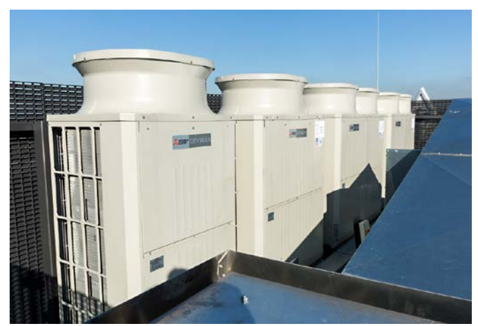
Thanks to the City Multi VRF-R2 system the energy consumption is reduced by 40 percent in the new building of the German Branch of Mitsubishi Electric